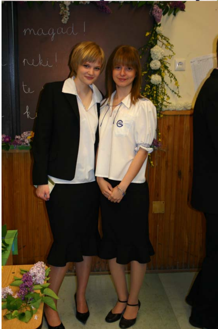
With another Judit (common name here 😊)