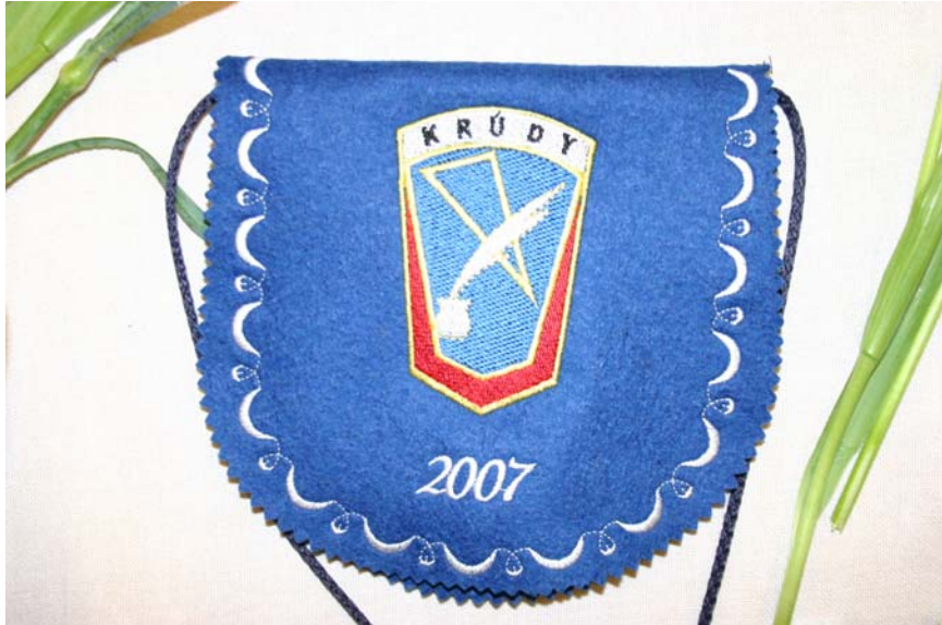
This is the bag we got as a goodbye present from the school, there's 1 forint in it with a dry biscuit and a quotation from someone famous