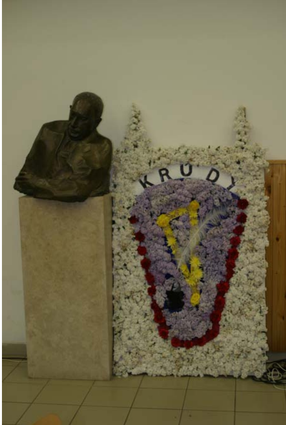
This is the writer after whom the school was named, he was local, but I personally don't like his books, he didn't seem to respect women a lot! That logo thing was made from flowers and it looked beautiful!